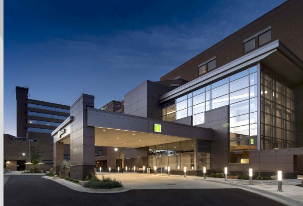
Parkview Randallia Hospital