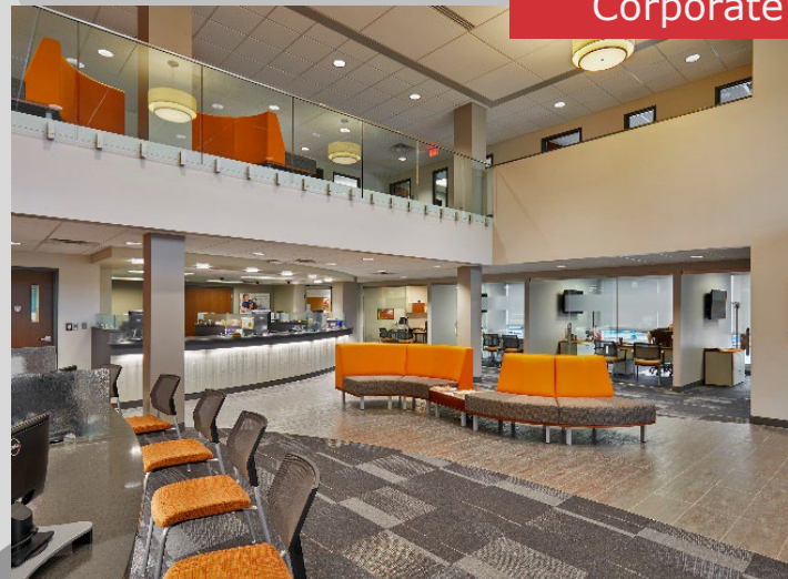
STAR Financial Group