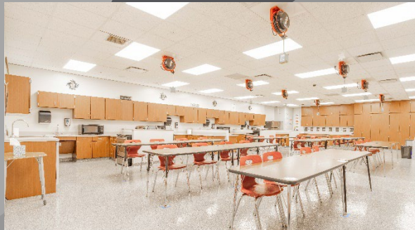
Plainfield Middle School Addn. & Renov.