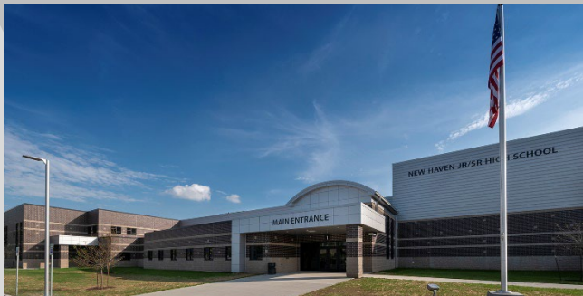
New Haven JR/SR High School