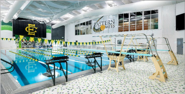
Eastern Howard Schools Natatorium