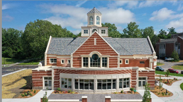
Culver Academies Schrage Leadership Center