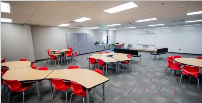
Bluffton-Harrison Elementary School