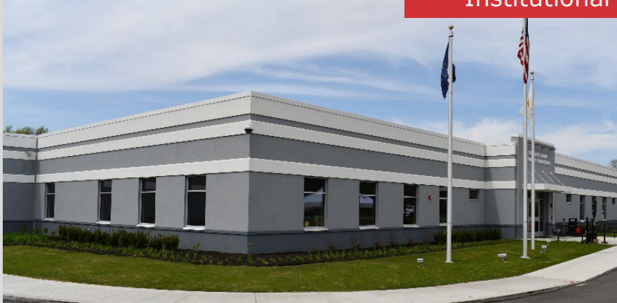
Tippecanoe County Community Corrections