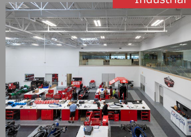
Ganassi Racing Headquarters