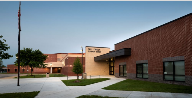
HSE Fall Creek Middle School Addn. & Renov.