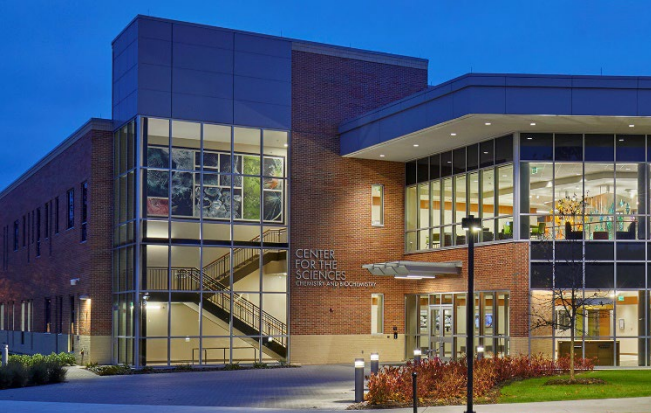
Valparaiso University Center for the Sciences