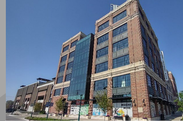
First Internet Bank HQ & Parking Garage