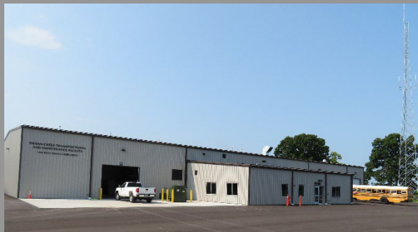
Indian Creek Transportation/Maintenance