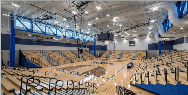
Homestead High School Expansion