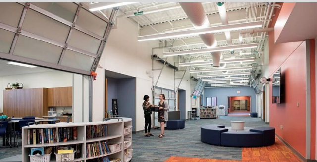
Lafayette Meadows Elementary School