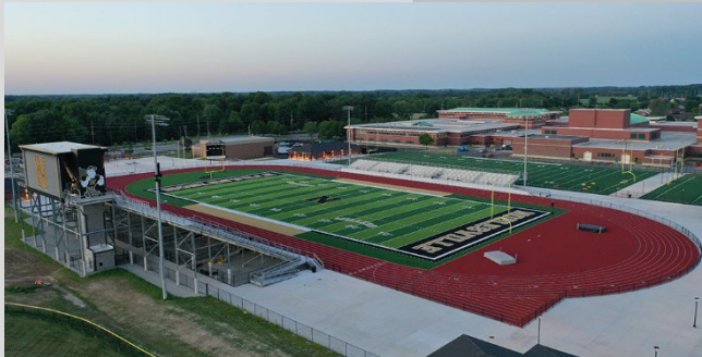
Noblesville Schools Stadium & Multi-use Fields