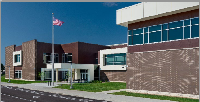
HSE Deer Creek Elementary School