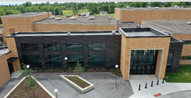
Wabash City Schools Middle/High School